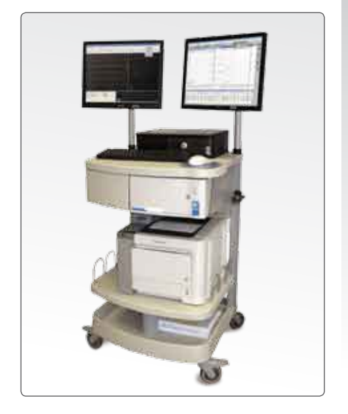
Optional cart for comfortable bed-side application.