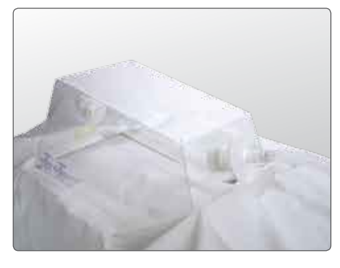
Nutritional Assessment with canopy hood (option).