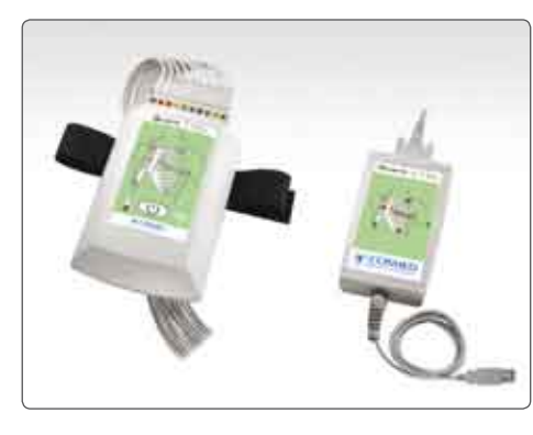
12-lead stress test ECG available in both wireless and Patient-cable configurations.